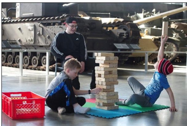
Children enjoying Awesome Sundays in the Lebreton Gallery