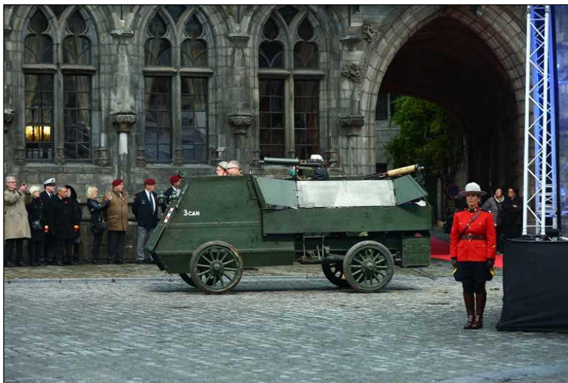
Armoured Autocar in Armistice Day Parade, Mons, Belgium

Thanks to the Friends, the Museum can continue each of these endeavours, providing generations of visitors with a window into Canadian military history — past, present and future.