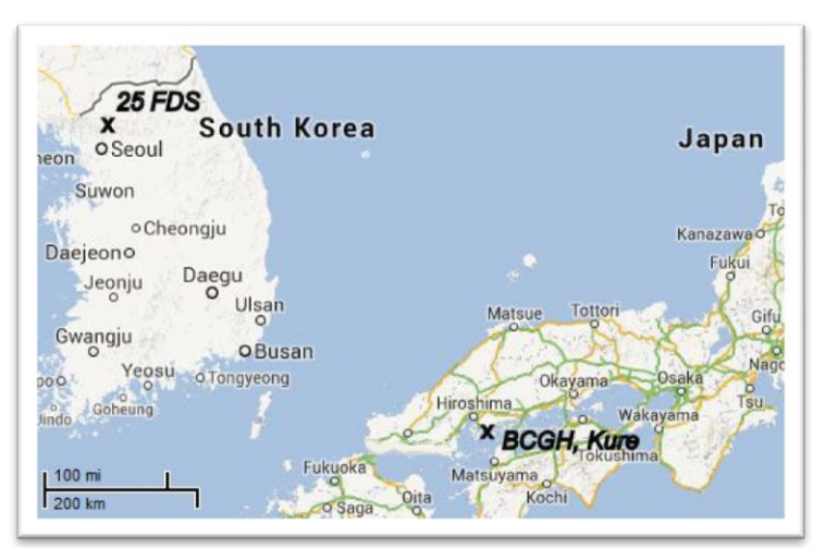
Figure 1 Map showing 25 FDS and BCGH Kure.

North Korean forces invaded South Korea on June 25, 1950. The United Nations Security Council declared war on North Korea that same month. In July, three Canadian destroyers were dispatched to Korean waters to serve under the United Nations command. That same month the Royal Canadian