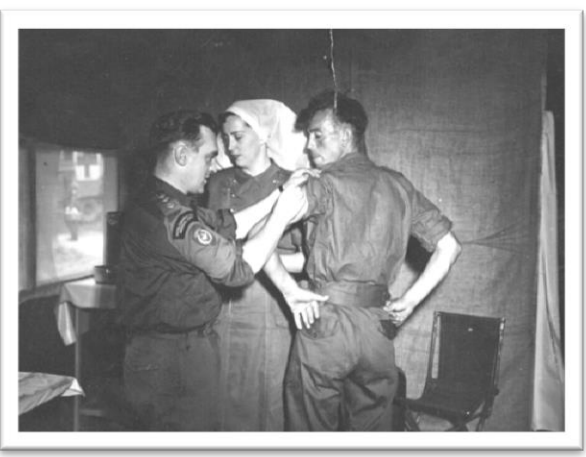
Figure 8 Inoculation of Returning POWs, 25 FDS, Korea, 1953.

A special ward was created at 25 FDS to process the walking POWs who were released in August, 1953 as part of Operation "Big Switch". (Stretcher cases were routed directly to the American MASH units.) Canadian and British POWs (and a couple of heavily bearded South African officers) arrived in trucks from the North over a period of about two weeks. Most were in pretty good health and excellent spirits but they weren't happy to be subjected to comprehensive series inoculations of duplicating, they said - the same inoculations they had been given days earlier by the Chinese