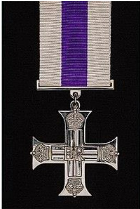
Military Cross awarded in May of 1918